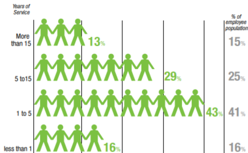
Fig. 1. Correlation between years of service and usage of OOO

...everyone, from newly hired employees to those who have been here for years